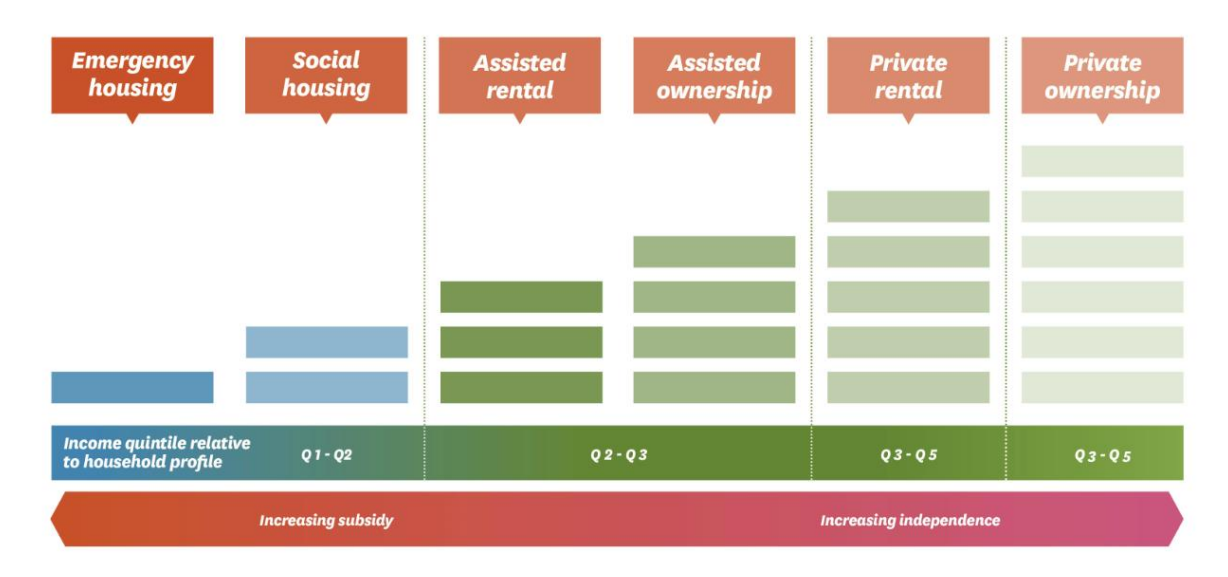
Figure 1: Community Housing, 2021. Housing Continuum. Available at: https://www.communityhousing.org.nz/housing-continuum/