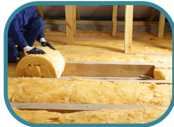
Use insulation to warm your home