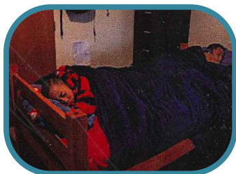
Sleep top and tail