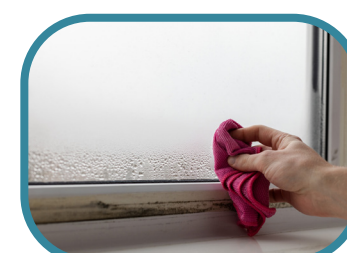
Wipe down condensation off windows