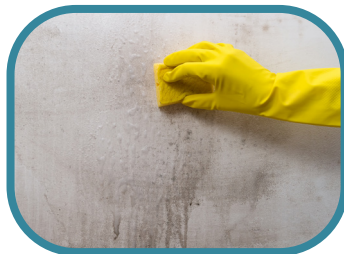
Wipe down mould