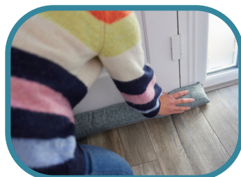
Stop draughts underneath doors