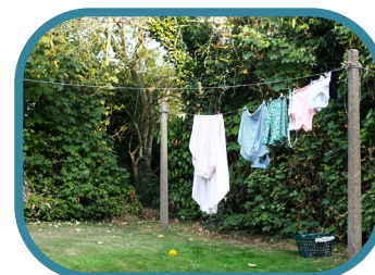
Hang your washing outside to dry