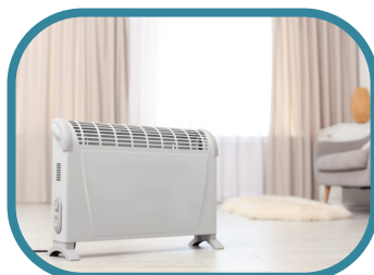
Keep the house warm with a heater