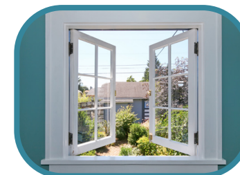
Open windows for a few hours a day