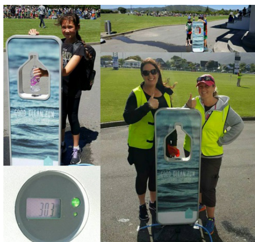
Example of a Hydration Station supplied by Healthy Families Lower Hutt.