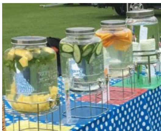
Water dispensers with fresh fruit and ice are part of the 'water kit' available from Healthy Futures.

There is a water-only schools section on the Regional Public Health website www.rph.org.nz/water-only-schools that has lots of tools, resources and links for more information. This page will be regularly updated with the latest information and tools.