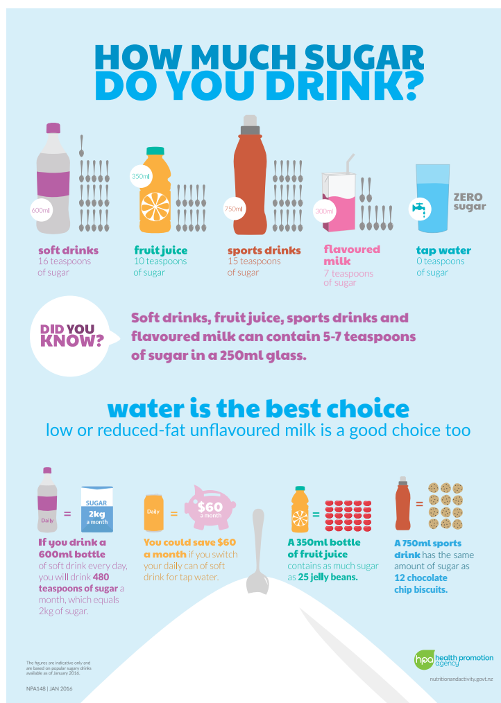
The 'How Much Sugar Do You Drink?' poster is one of the resources available from the Health Promotion Agency.